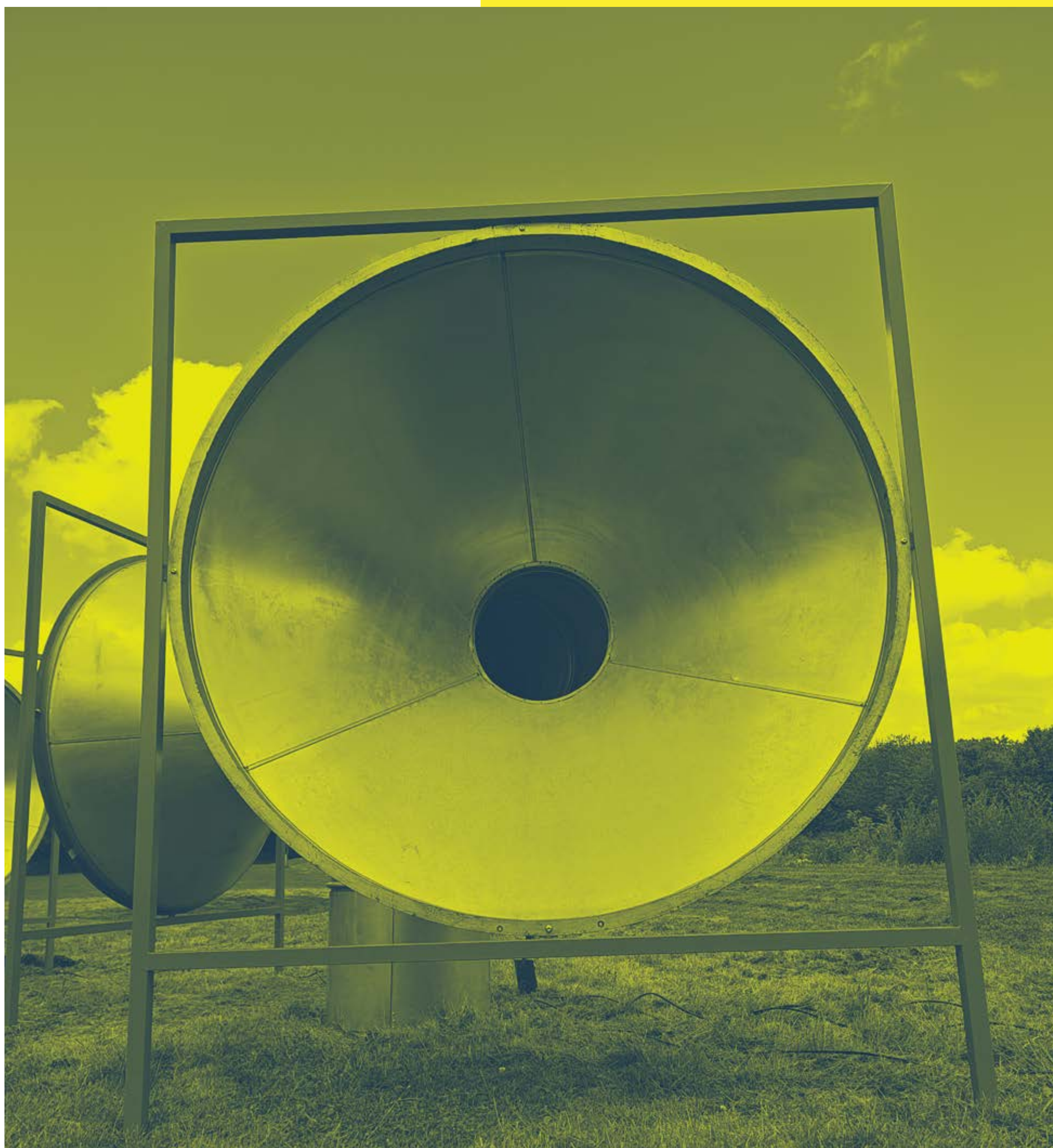
Sound Wave Collider at Flashes of Nature, Festival, Pennington Flash, 4th - 6th July 2025