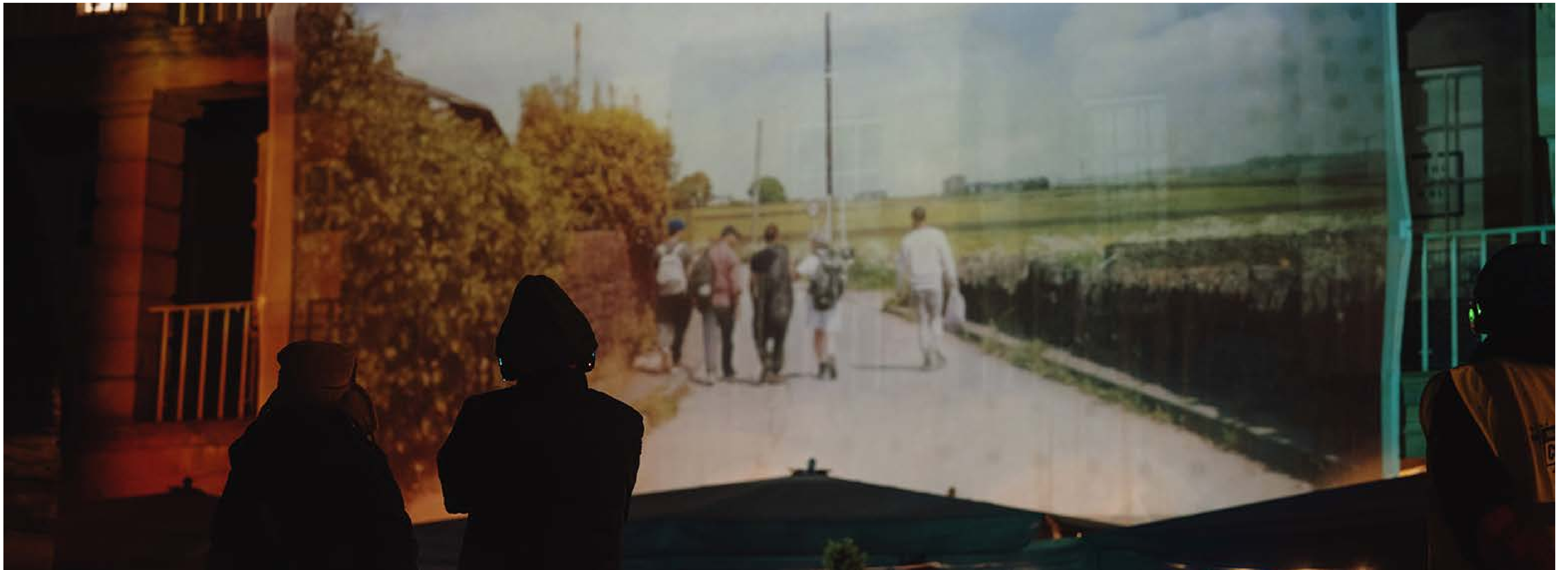
THIS LANDSCAPE IS OURS BY BREAKING BARRIERS & IOU CREATION CENTRE, 2025, HALIFAX TOWN CENTRE.